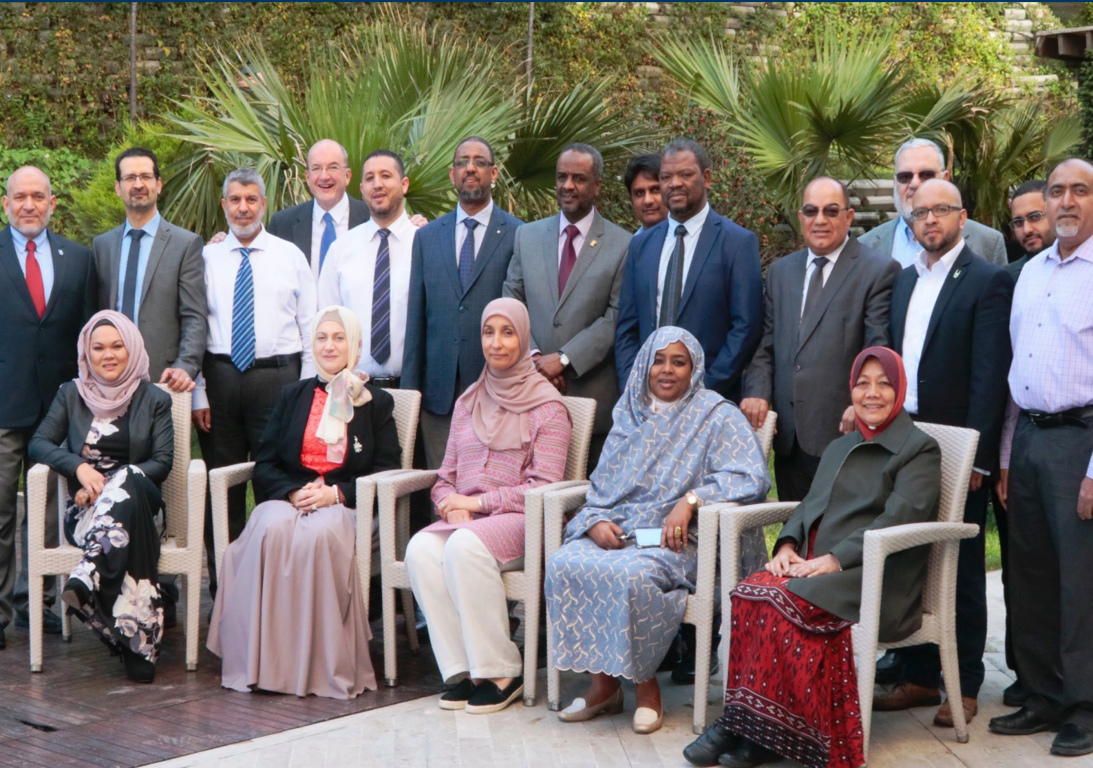
Leadership Development Programme Cohort, May 2017 delivered in Turkey