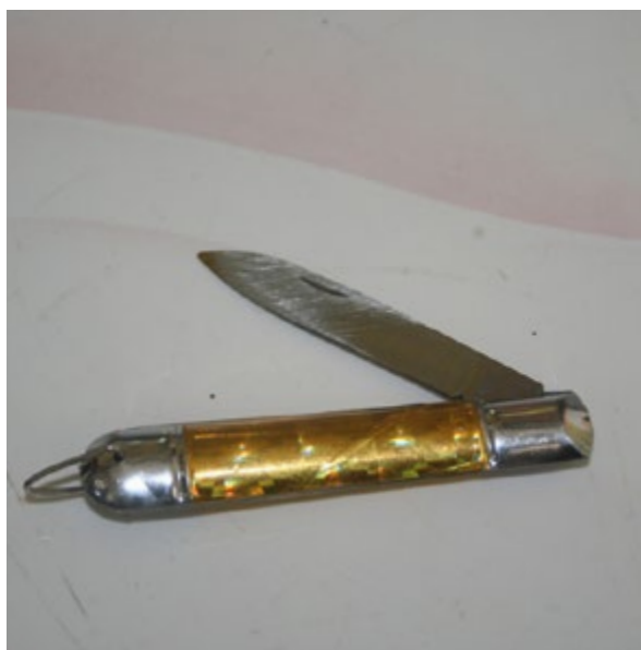
This tool is used by a traditional midwife in Padang to perform FGC

Any awareness that was present in Lombok resulted from a government scheme in the area which imposes penalties on midwives who perform FGC without medical supervision. In Padang, awareness came about through the media