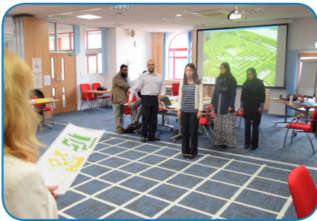
The Aspiring Managers Programme (AMP) took place at IR Academy, Birmingham, UK.