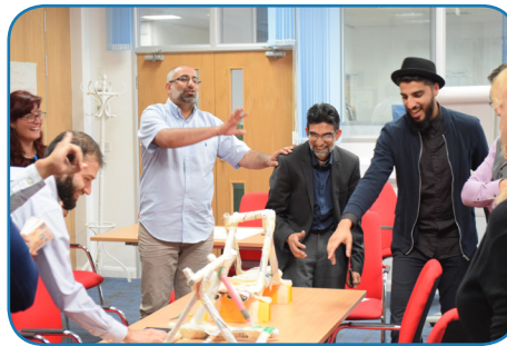
Management Development Programme (MDP) took place at IR Academy, Birmingham, UK.