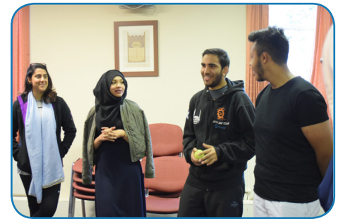
IR Volunteers Training in Leicester