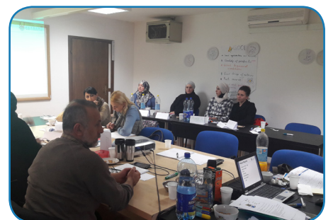
IR Bosnia in Presentation Skills training.