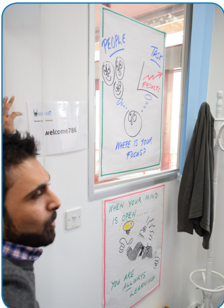
Cartooning for Trainers, Workshop at IR Academy at Birmingham UK.