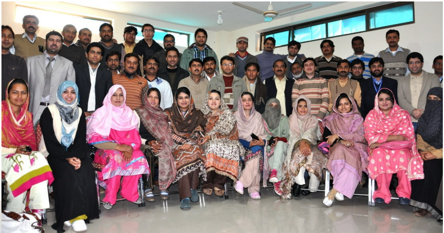
Islamic Relief staff from Multan poses for a group photo during their visit to Country Office, Islamabad.