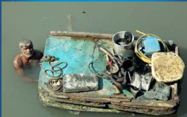
"Pakistan drowning into Debt"

"We appreciate the PML-N's commitment, expressed in its Election manifesto 2013 to reduce country's dependence on foreign loans. However, this promise is yet to be translated into action through undertaking solid and alternative measures to reduce the chronic debt burden."