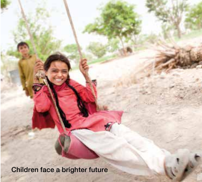
Children face a brighter future