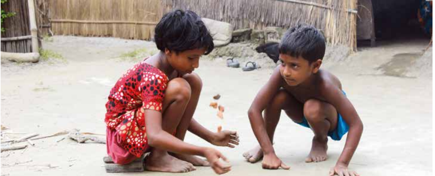
Children play safely, out of reach of seasonal flooding, on land raised by Islamic Relief at South Kabilpur