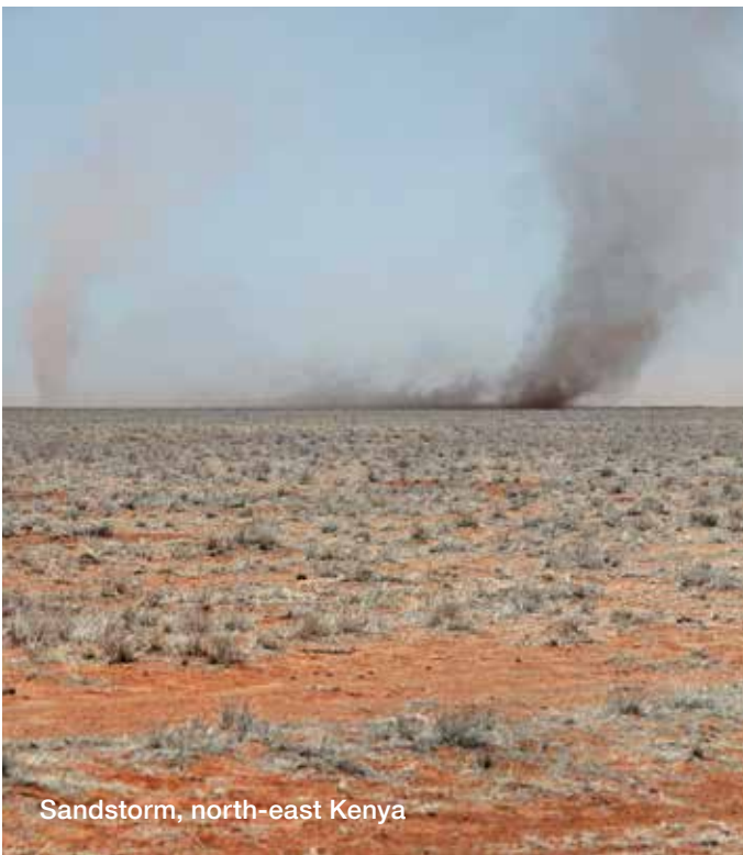
Sandstorm, north-east Kenya