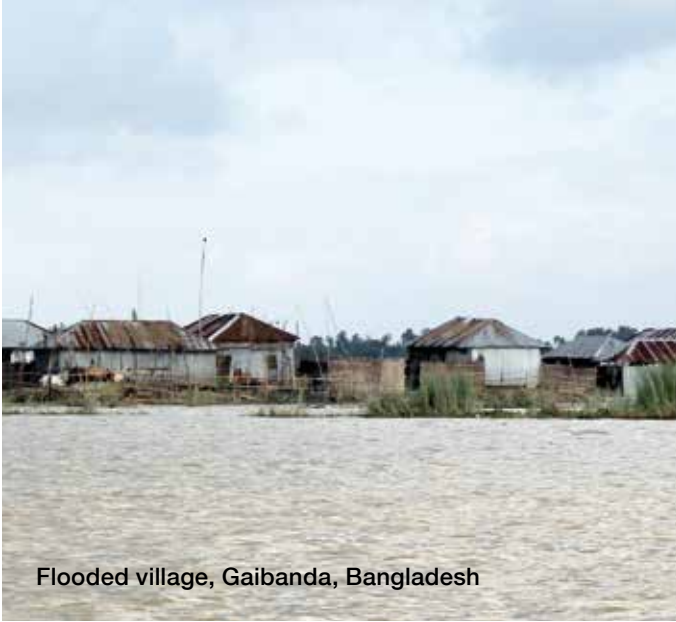
Flooded village, Gaibanda, Bangladesh