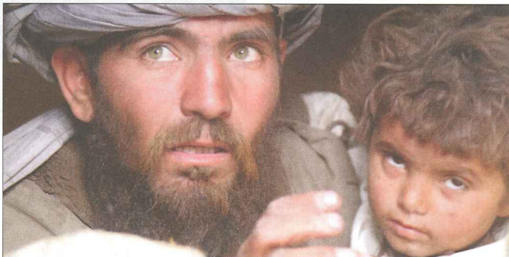
Refugees at Spin Boldok camp