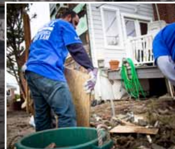
IRUSA volunteers help with cleaning and repair efforts in New Jersey after Hurricane Sandy.

Shelter was provided for seven days, with the majority of individuals and families being placed in transitional housing. For three weekends after Hurricane Sandy, DART conducted home assessments in Union Beach and Jersey City, NJ, to determine which damaged houses were salvageable. For salvageable structures, "muck out" was performed by DART teams. They removed debris, damaged drywall, carpet, and flooring. Toward the close of 2012, DART partnered with New Jersey-based SMILES to provide food to impacted families in Wildwood and Plainfield, NJ. That effort continues.