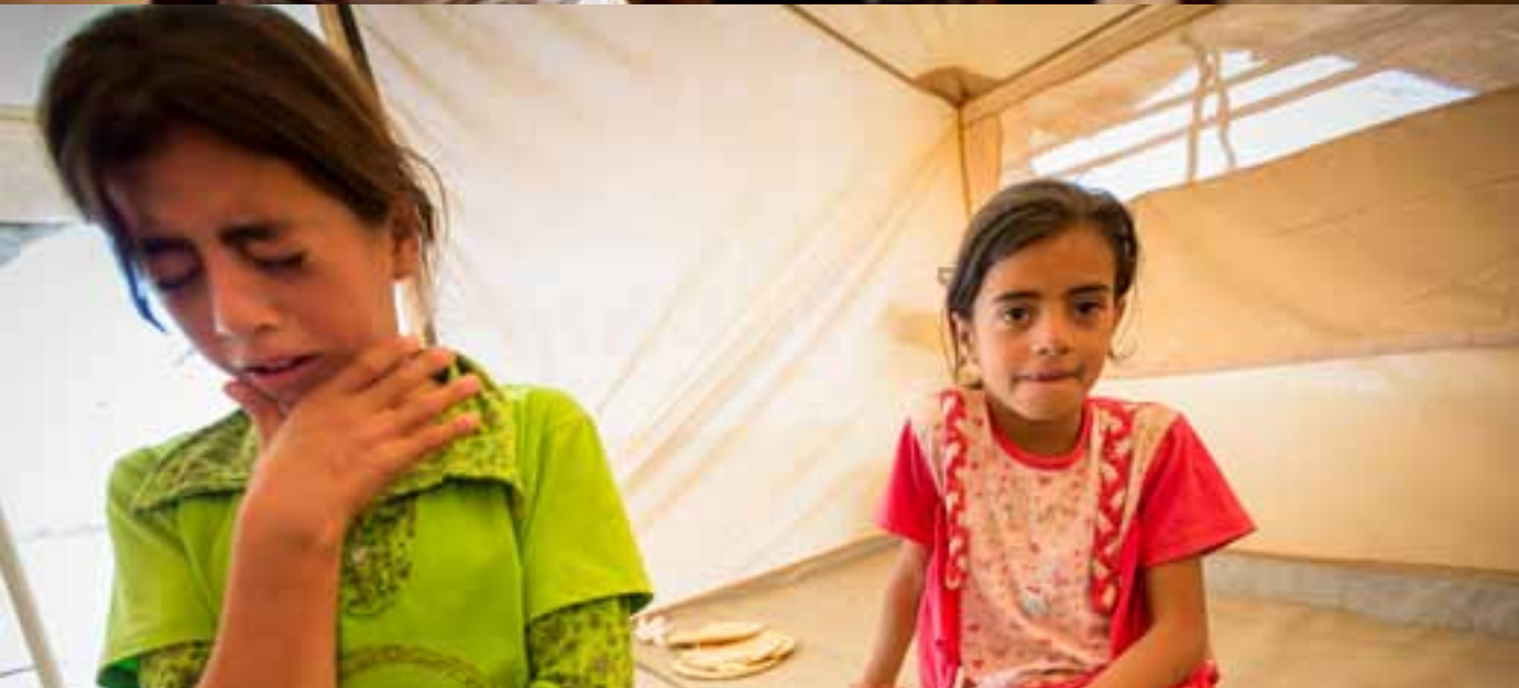
ABOVE: It aged them. Living in the dust had cracked their eyes and tore at their skin. The real damage was being done inside their small lungs. The coughing and wheezing from the dust made children collapse in the midst of playing. Even sitting was difficult. Many adults claimed that it was the children that kept them strong. Their children had endured so much already, and it was their children that kept them living. In their children they saw better days. It was hard to understand why children like these should have to grow old so quickly, why they had to be symbols of perseverance and hope through this violence.