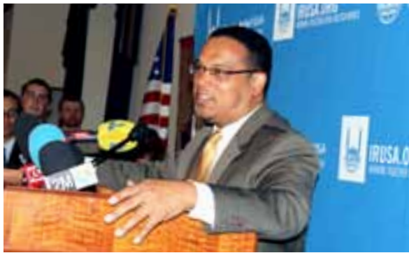
Congressman Keith Ellison presents at Islamic Relief's Ramadan reception on Capitol Hill.