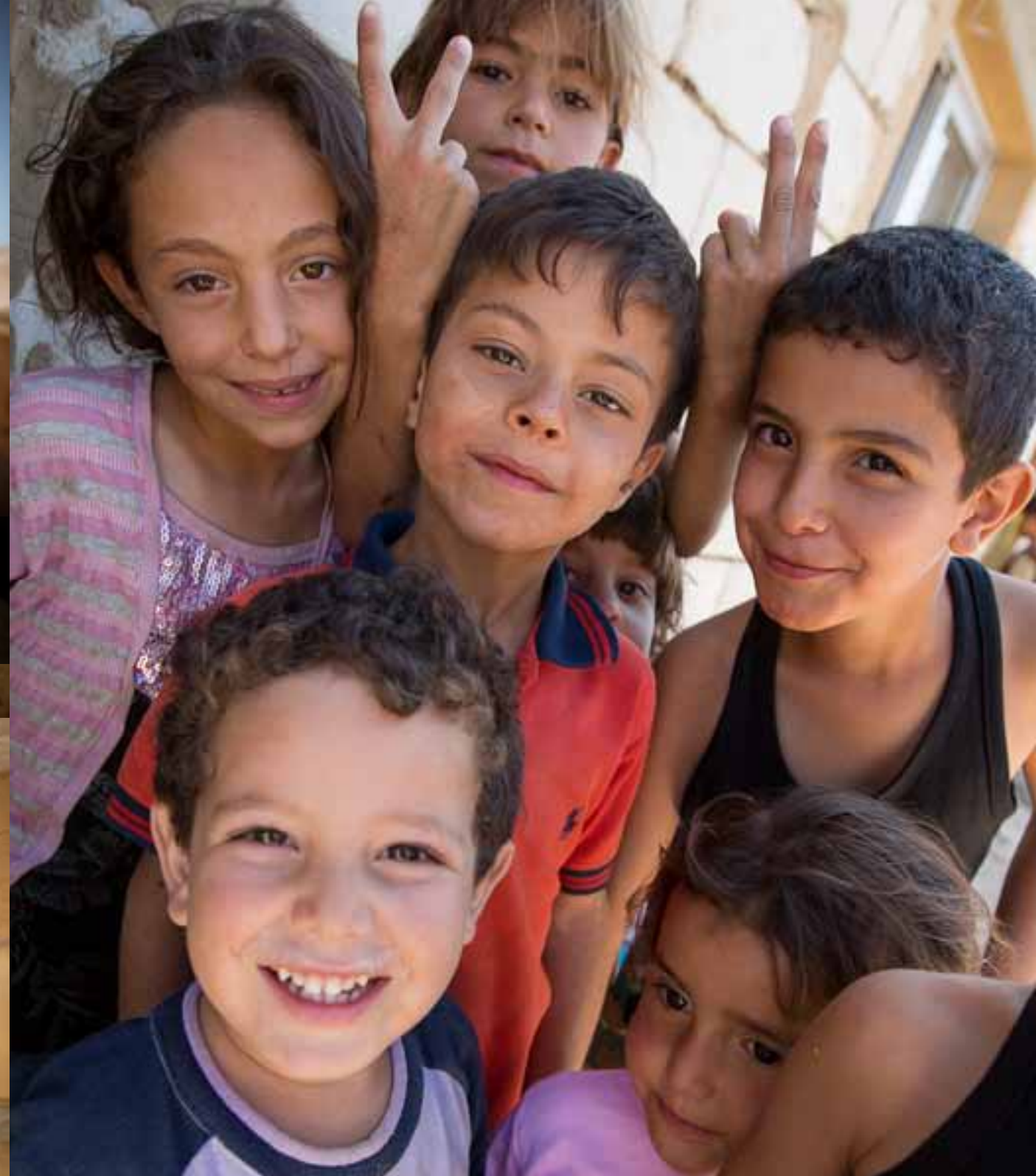
ABOVE: They had fled Syria to find a haven, a place to sleep safely, somewhere away from bullets and blood, somewhere with some relief. At Zaatari and other border camps like it, we heard some say in whisper that these children came here to die.