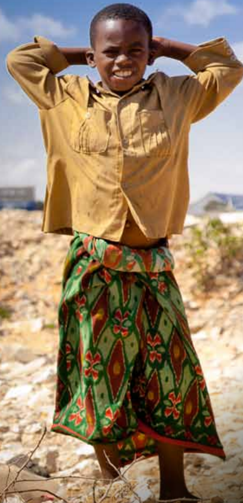
ABOVE: Young boy waiting for his turn at the water pump in Siliga camp in Mogadishu, Somalia.

We can help keep children out of danger. We can help prevent disease, get children proper nutrition and care, and ensure they have a good education. Solutions are possible. When children are given the right tools, care, and opportunities, they can live and grow with dignity and realize their full potential.