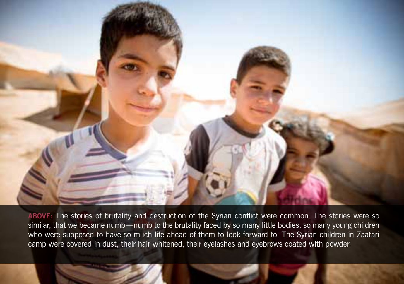
ABOVE: The stories of brutality and destruction of the Syrian conflict were common. The stories were so similar, that we became numb—numb to the brutality faced by so many little bodies, so many young children who were supposed to have so much life ahead of them to look forward to. The Syrian children in Zaatari camp were covered in dust, their hair whitened, their eyelashes and eyebrows coated with powder.