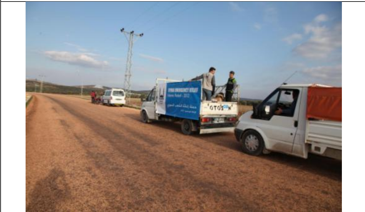
Entering the deliverables