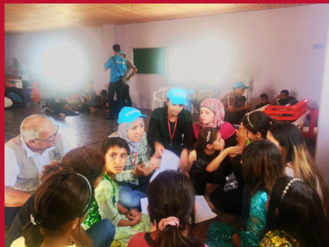
Joint needs assessment by Islamic Relief and UNICEF - Iraq

In addition, a regional meeting was held in Amman / Jordan in June 2013 where all IR partners and senior managers discussed IR strategy for the coming stages of the Syrian Humanitarian intervention.