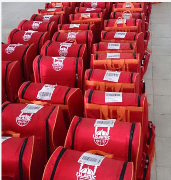
170 medium medical bags and 25 advanced distributed for the medical points in hot areas.