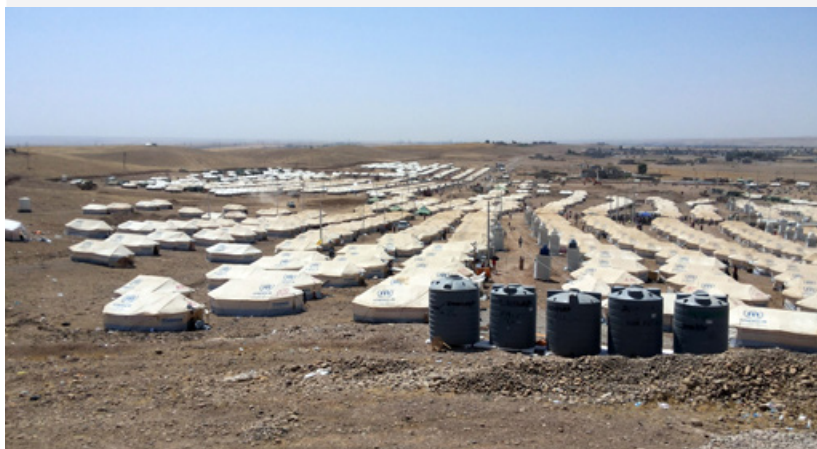
Syrian Refugees in Domiz Camp Kurdistan - Iraq