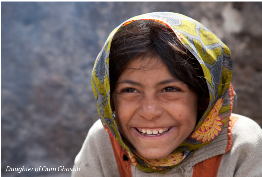
Daughter of Oum Ghassib

At the end of the interview she thanked Islamic Relief for this food package, Hygiene kit and mattresses and she asked if we can help them in the future to find a secured shelter where she can live with her family away from the bombing and the fire.