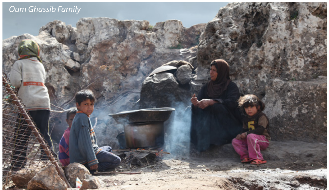
Oum Ghassib Family