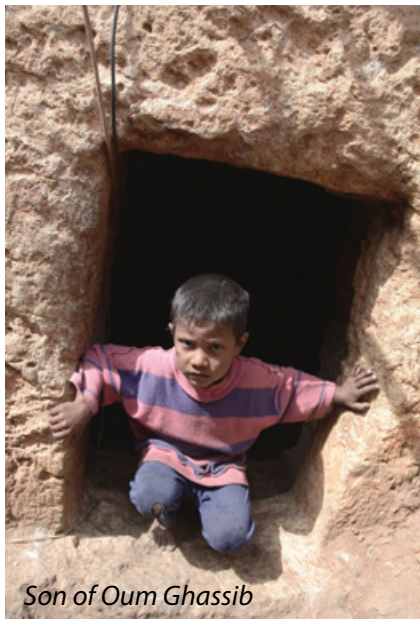
Son of Oum Ghassib