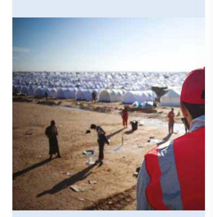
Little remains in practice of a forced migrant protection framework that spanned centuries of Islamic history

Alternatively the musta'min may choose to end the asylum voluntarily and return to their country of origin. This may be the result of changing circumstances, for example if the reasons motivating asylum were to cease (Abou-El-Wafa 2009: 226). For example, following the Hudaibiyah truce, the Prophet (PBUH) dispatched 'Amr ibn Umayyah ad-Dhimari to Negus requesting him to send back the Muslims who had taken refuge with him (Abou-El-Wafa 2009: 206). As mentioned earlier however, it is incumbent on the host state to ensure that it is safe for the musta'min to return to their country of origin and to facilitate their safe passage (Q9:6).